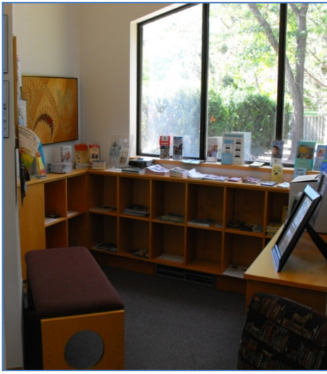
Figure 3 Nobleton Library - Under-utilized Space