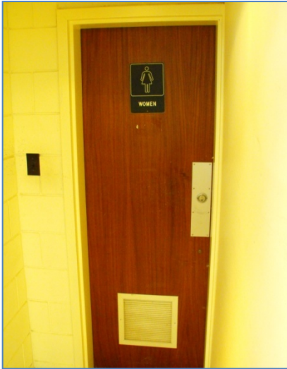
Figure 1 King City Library - Inaccessible Washrooms