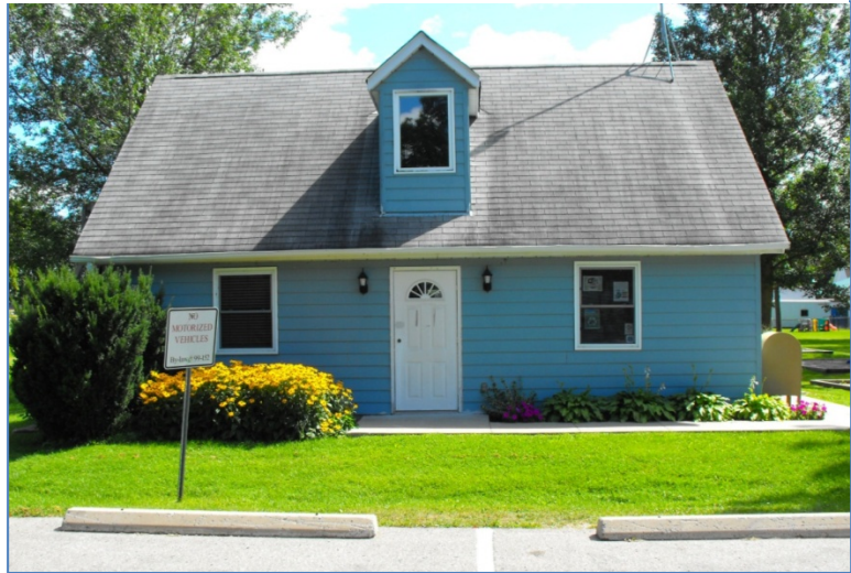
Figure 12 Ansnorveldt Library

The adjacent private school is currently planning to relocate outside of Ansnorveldt. Some of the library's hours are specifically tailored to school use, but staff anticipate re-allocating hours to maximize community use; to this end, a public survey was launched in late 2013 to identify operating hours that would be convenient to the majority of users.