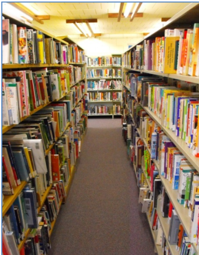
Figure 5 King City Library - High Stacks