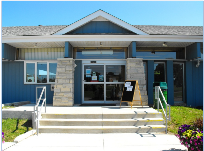
Figure 7 King City Library

Primary challenges associated with this library include: