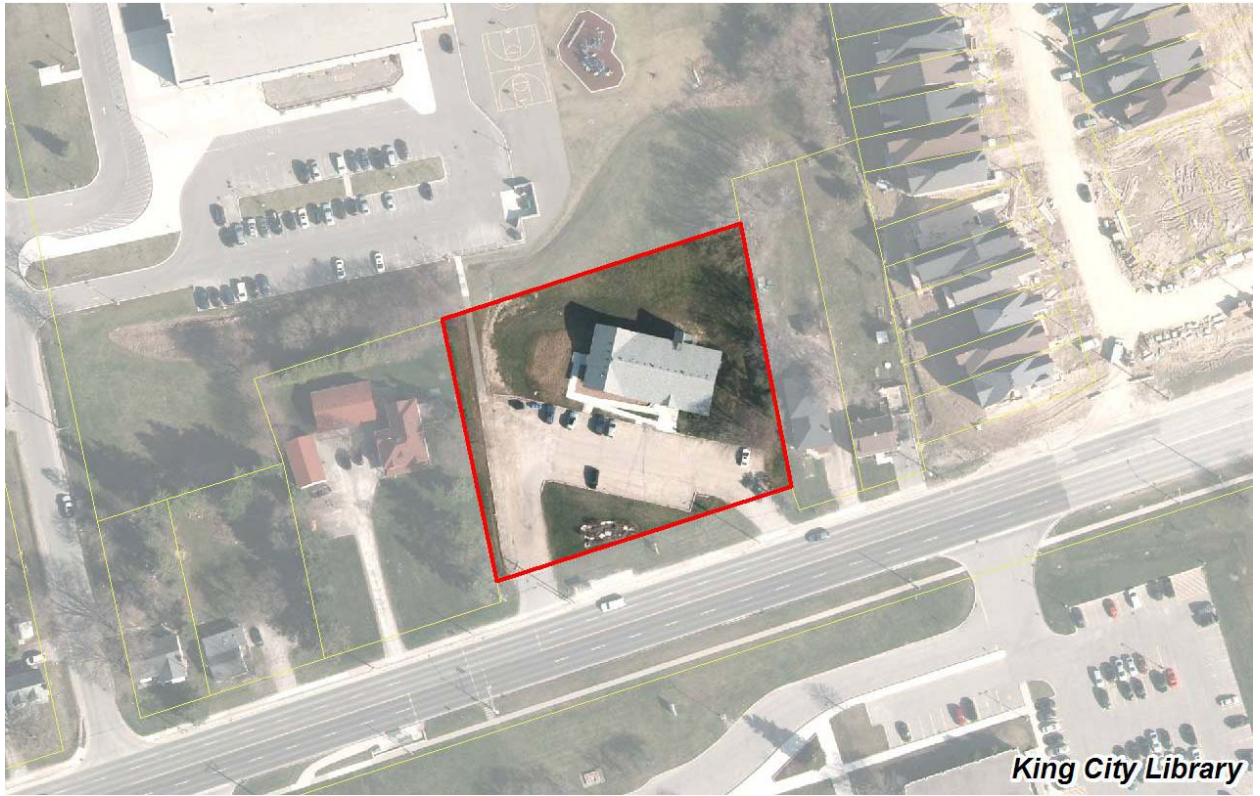
King City Library