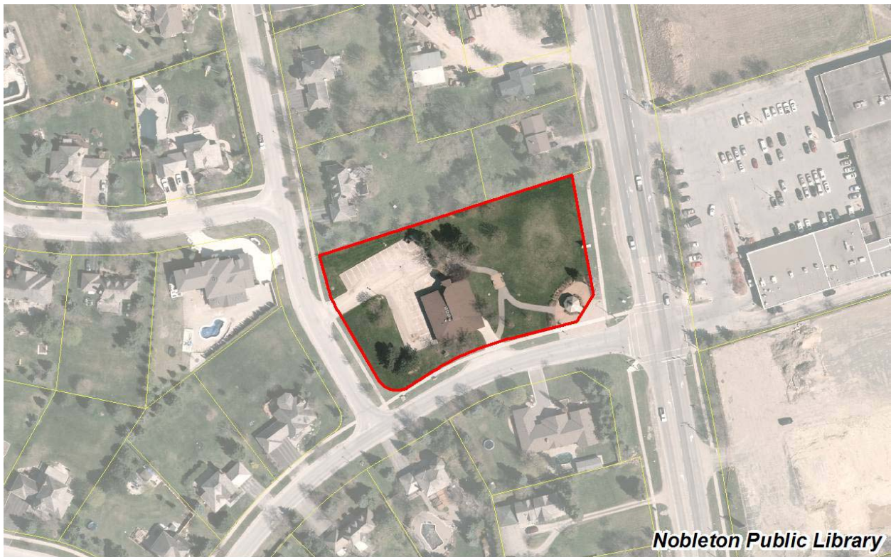
Nobleton Public Library