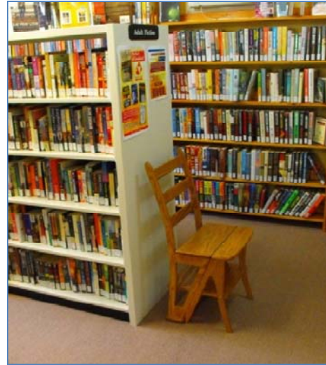
Figure 2 Ansnorveldt Library – Seating