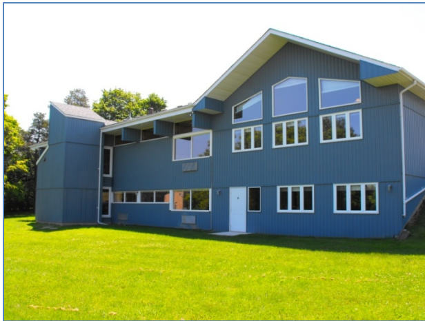
Figure 8 King City Library - Expansion Potential