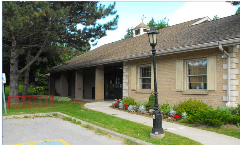
Figure 11 Schomberg Library

Primary challenges associated with this library include: