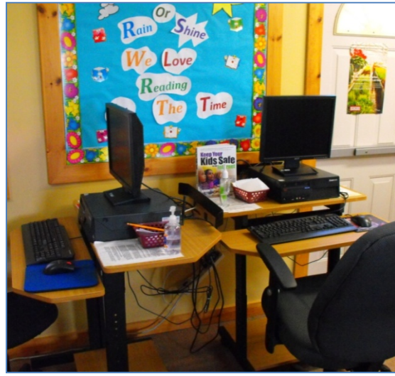
Figure 4 Ansnorveldt Library - Public Workstations